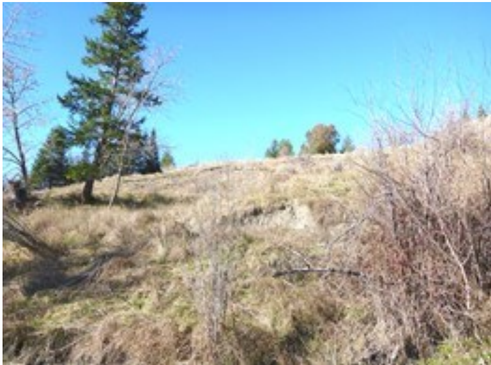
A steep grazed bank with slumping exacerbated by cattle pressure will be fenced and planted with native trees to help reduce the loss of soil to the stream below.