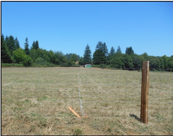
Bill Mast K-Line irrigation project July 24, 2013

This grant project, partnered with the NRCS EQIP program, was able to assist the landowner to install a 54 pod K-line irrigation system which includes approximately 3,600 feet of buried mainline that ranges from 2"-4" PVC pipe. This project has improved irrigation efficiency on approximately 31 acres of grazing and hay pasture that border 3,827 feet of river. This project now connects 2.75 miles out of a 4.75 mile stretch of recent irrigation efficiency projects on the North Fork of the Coquille River.