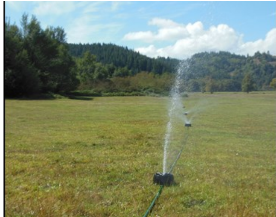
Dal King K-line irrigation project: Sept 4, 2013

This grant project, partnered with the NRCS EQIP program, was able to assist the landowner to install a 54 pod K-line irrigation system which includes approximately 3,600 feet of buried mainline that ranges from 2"-4" PVC pipe. This project has improved irrigation efficiency on approximately 31 acres of grazing and hay pasture that border 3,827 feet of river. This project now connects 2.75 miles out of a 4.75 mile stretch of recent irrigation efficiency projects on the North Fork of the Coquille River.