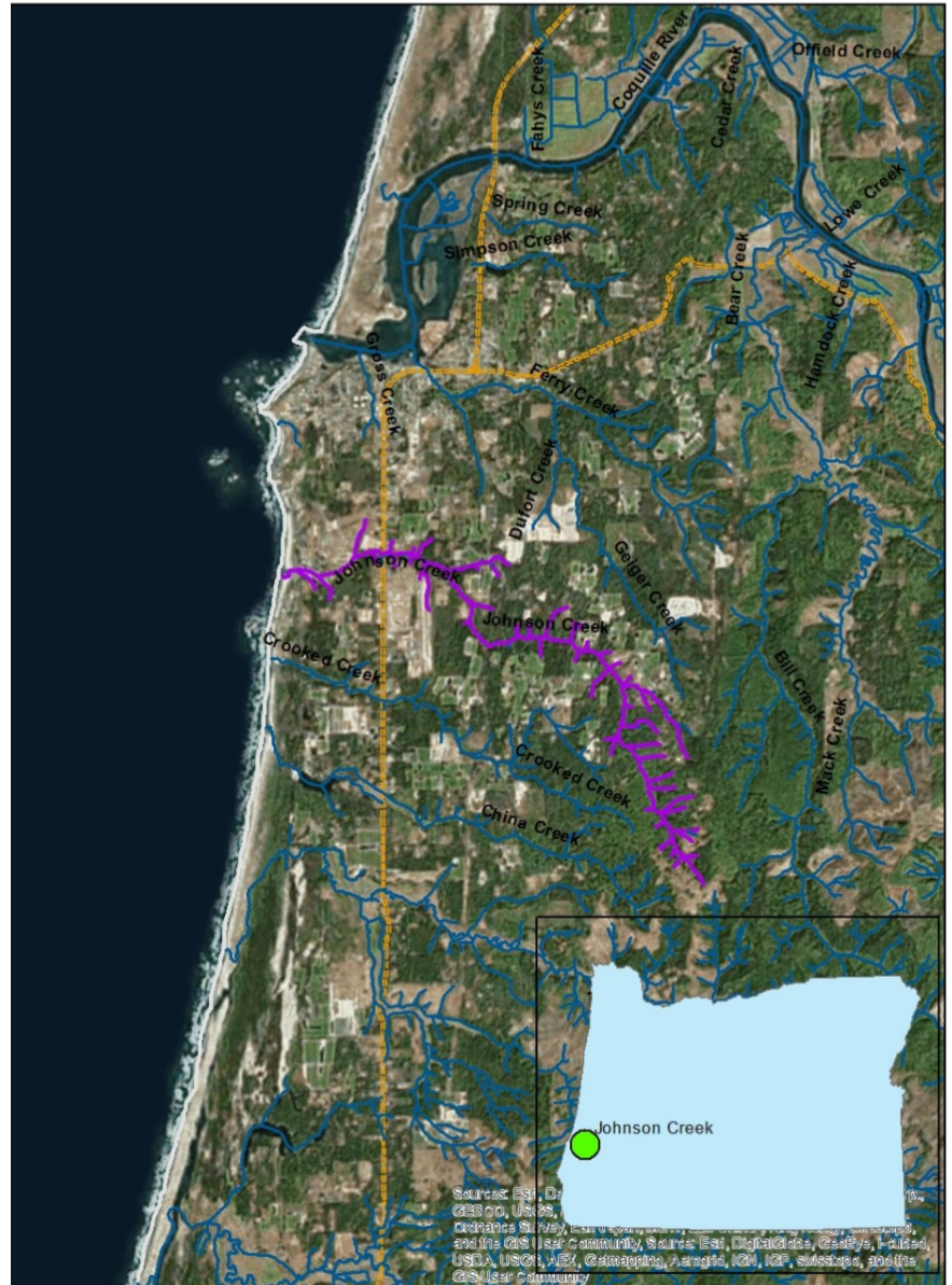
Figure 1. Johnson Creek watershed, located south of Bandon, OR.

The final report of the Johnson Creek Survey and Assessment is still being compiled, and is scheduled to be made available to the public in early 2015. Printed color copies will be sent to each landowner on Johnson Creek who participated in the survey, and a digital copy will be available on the Coos SWCD website. If you would like a copy of the Assessment please contact the Coos SWCD District Office. This report will provide a more firm understanding of the water quality, invasive plant, and fish passage conditions in the watershed providing critical information to move forward with project development and obtaining grant funding for projects.