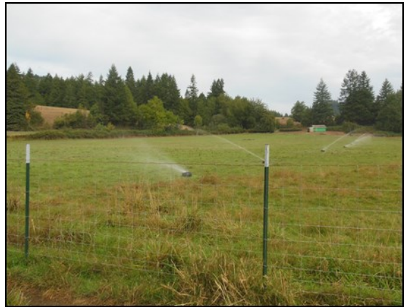
Bill Mast K-Line irrigation project: Sept. 4, 2013

This grant project, partnered with the NRCS EQIP program, was able to assist this landowner to install a 208 pod K-line irrigation system which also includes approximately 8,300 feet of buried mainline that ranges from 2"-6" PVC pipe. This project has improved irrigation efficiency on approximately 75 acres of grazing and hay pasture that border one mile of stream. This project now connects 2.16 miles out of a 2.75 mile stretch of recent irrigation efficiency projects on the North Fork of the Coquille River.