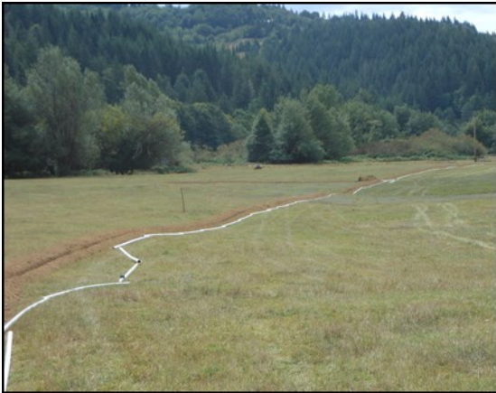
Dal King K-Line irrigation project: Aug. 27, 2013

These projects were part of an ongoing effort to address poor irrigation systems and management education along with riparian habitat & buffer improvement in the Coquille watershed area.